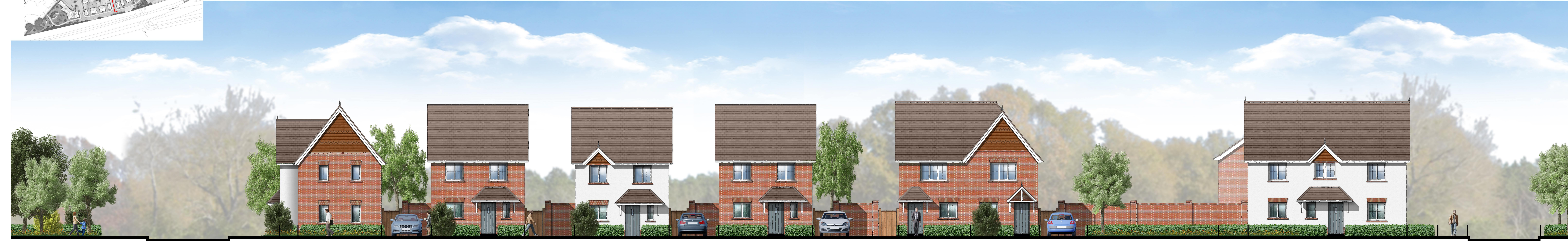
House Type N Plot 1